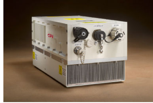
CPI GaNLink™ 80 W Ka-band GaN SSPA / BUC, Model SA49KOA / SB49KOA

Backed by over 40 years of satellite communications experience, and CPI's worldwide 24-hour customer support network that includes more than 20 regional factory service centers.