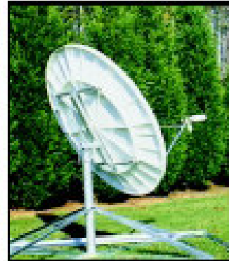
Back View 1.8M Rx/Tx